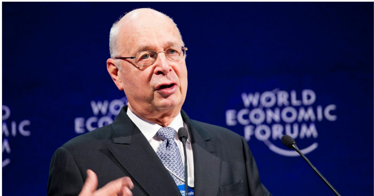
Klaus Schwab, founder and executive chairman of the World Economic Forum.

Miss a day, miss a lot. Subscribe to The Defender's Top News of the Day. It's free.